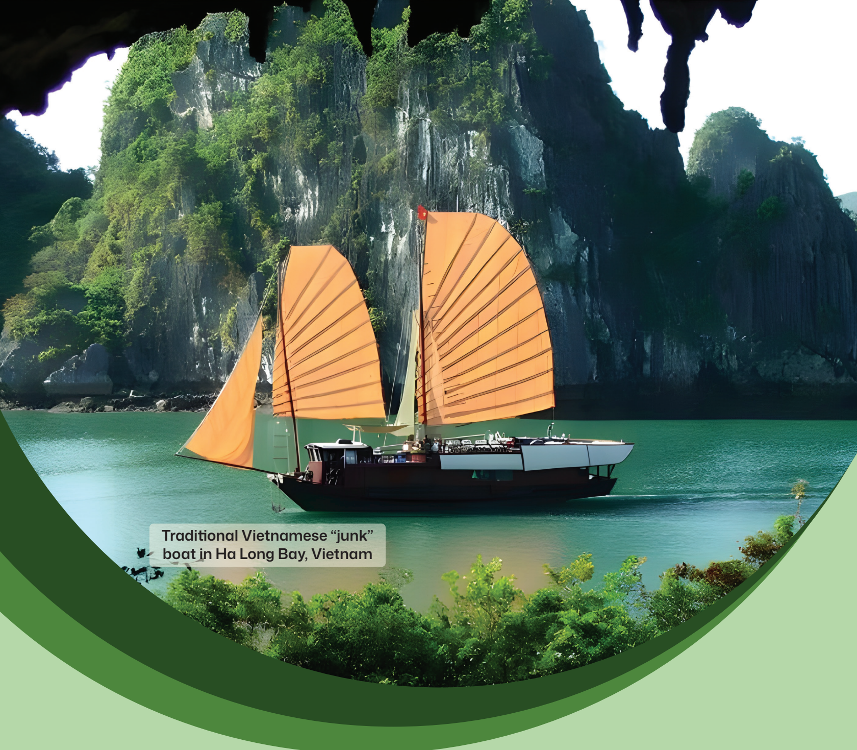
Traditional Vietnamese “junk” boat in Ha Long Bay, Vietnam